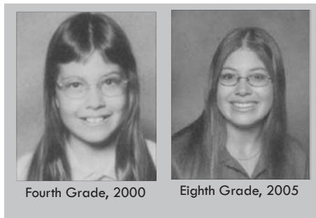
Fourth Grade, 2000