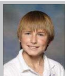
Eighth Grade, 2007